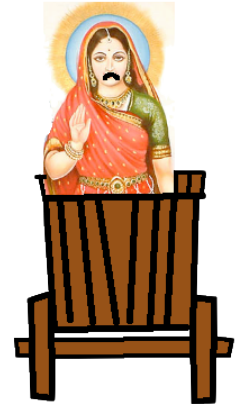
Sita is kidnapped by Ravana.